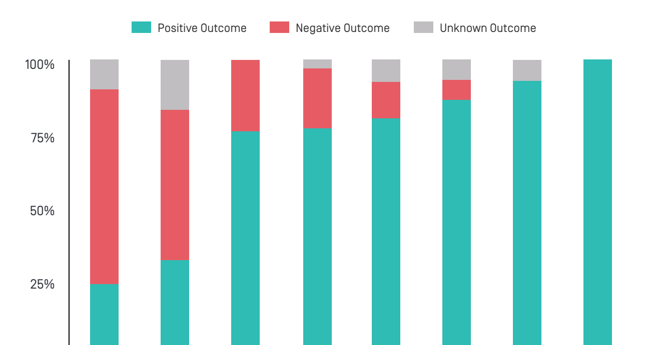
Figure 2 | Outcomes for Hostages held by Jihadists, by Nationality

There are at least 14 Western hostages, including six Americans, currently being held by terrorist and militant groups. Seven of the 14 are being held by the Taliban-affiliated Haqqani network. Of the remaining seven Western hostages, three are held by Al-Qaeda in the Islamic Maghreb (North Africa), two by Abu Sayyaf in the Philippines, one by ISIS, and one by an unknown group in